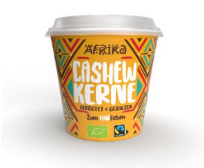
ALDI SÜD Germany, ALDI SUISSE, ALDI Italia, ALDI Hungary and HOFER Austria and HOFER Slovenia